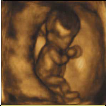
9-week-old baby "stepping" in the womb

Instead, she waited for her lifesaving treatment until they had been born.