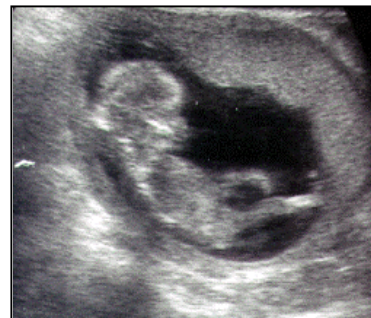
12-week-old baby kicking inside the womb