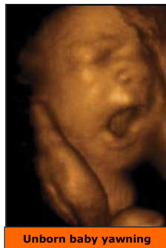
Unborn baby yawning