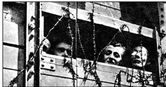
Jewish women from Thessalonika, Greece, in the railcars on the way to Treblinka death camp

A railroad track ran behind our small church, and each Sunday morning we would hear the whistle from a distance and then the clacking of the wheels moving over the track. We became disturbed when one Sunday we noticed cries coming from the train as it passed by. We grimly realized that the train was carrying Jews. They were on their way to the death camps (Emphasis added).